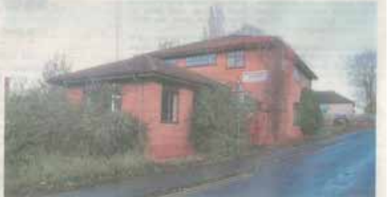
The former Wilsons Medical Centre in Carlton.

"A decision is expected to be reached on the application by the end of April."